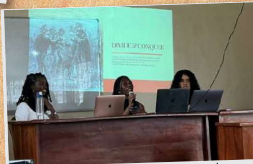
BLSA students had time to exchange with fellow law student at University of Rwanda