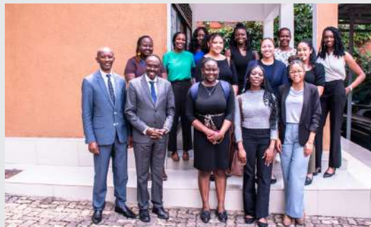
Executive Director met BLSA students who were on tour in Rwanda

The Legal Aid Forum was delighted to receive a delegation from the Black Law Students Association of the University of Pennsylvania Carey Law School on their 2024 Pan-African study visit to Rwanda aimed at Human and Civil rights frameworks, with a focus on Constitutional and Legislative changes initiated by the Rwandan Government to confront discrimination and divisive Genocide ideology. Some of the institutions they visited include: