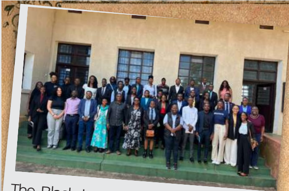
The Black Law Students Association at the University of Pennsylvania Carey Law School visited the University of Rwanda

The Black Law Students Association at the University of Pennsylvania Carey Law School visited the University of Rwanda, where they made a presentation to fellow Law Students on Comparative Analysis of Human and Civil Rights in light of the 60th anniversary of the USA's 1964 Civil Rights Act. The delegation had time to tour the Centre for Legal Aid and Mediation, observing how law students provide legal aid services to beneficiaries in legal aid clinics.