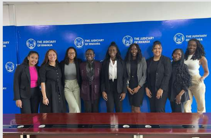
BLSA students at Rwanda Judiciary