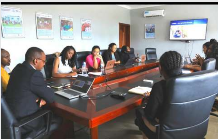
BLSA students at Interpeace

The Black Law Students Association from the University of Pennsylvania Carey Law School visited Rwanda Judiciary and International Organization for Peacebuilding, exploring the digitization of Rwanda's Court System and the crucial role of reconciliation in uniting the Rwandan society post-1994 genocide against the Tutsi