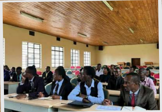
BLSA students had time to exchange with fellow law student at University of Rwanda