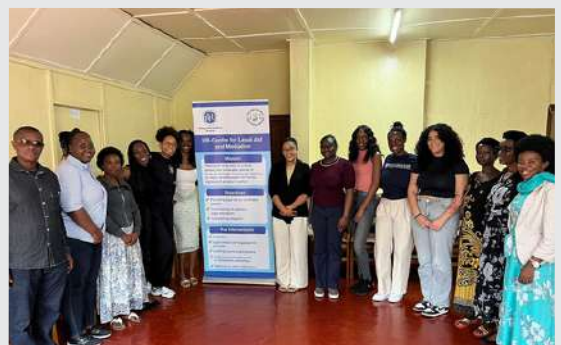
BLSA students BLSA students visited Avega Agahozo