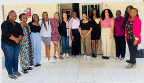
BLSA students visited Avega Agahozo

The Black Law Students Association from the University of Pennsylvania Carey Law School had time to visit the Avega Agahozo at its headquarters to learn about Women's leadership in reconstructing communities After Conflict (1994 genocide against Tutsis): in this topic, they discussed how women-led initiatives fostered reconciliation, promoted dialogues, to build bridges between different groups with post-conflict societies.